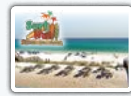
8 SURF HUT Miramar Beach