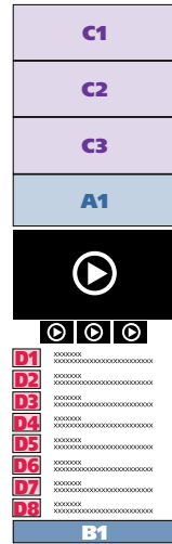
Mobile Ad Layout