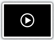
1 COMING SOON Pensacola Beach

COMING SOON TO THE BEACHES OF CENTRAL AND SOUTH FLORIDA!