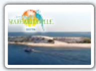
4 MARGARITAVILLE HarborWalk Village