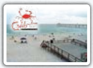
2 THE CRAB TRAP Okaloosa Island