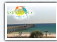
10 MARGARITAVILLE Panama City Beach