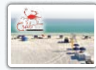
7 THE CRAB TRAP Destin